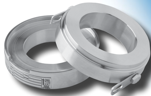
UHZ Disk Holder