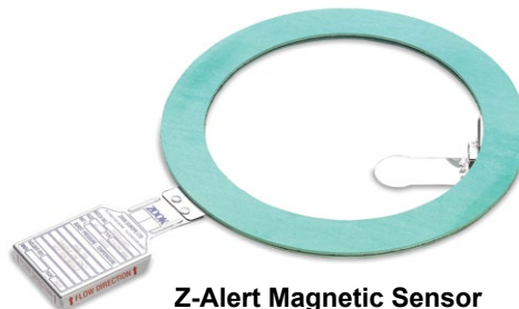
Z-Alert Magnetic Sensor